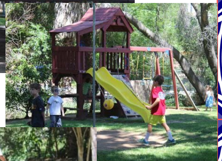
Good food, Good Friends, Good music, Good baked good, horseshoes and now Corn Hole! Not to mention a beautiful day to Memorialize those that fought for our freedom and gave the ultimate sacrifice.