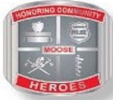
Lodge & Chapter Pin