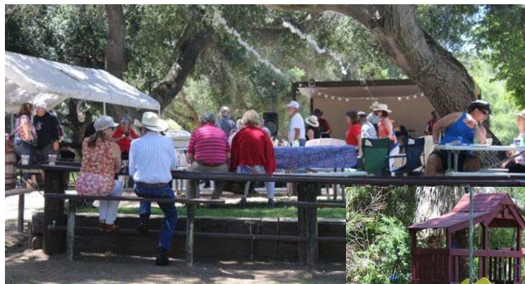
Memorial Day picnic, first picnic of the season and a good time by all who attended!