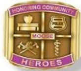
Moose Legion Pin