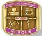
Moose Legion Pin