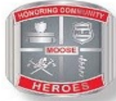
Lodge & Chapter Pin