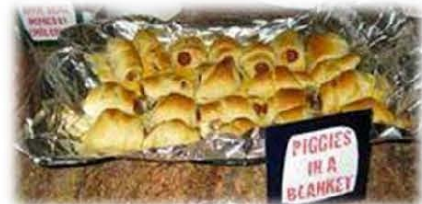
PIGGIES IN A BLANKET

Pot luck... BRING YOUR FAVORITE REDNECK DISH TO SHARE!