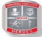
Lodge & Chapter Pin