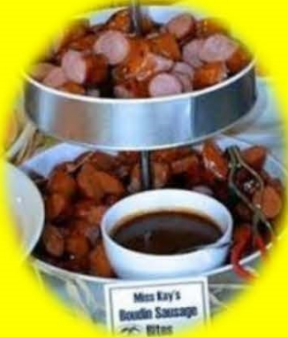
RED NECK SAUSAGE & BEANS! YUMMY!