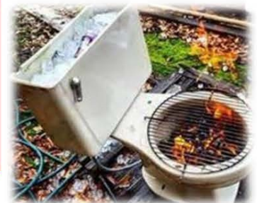
RED NECK BBQ & ICE CHEST

Pot luck... BRING YOUR FAVORITE REDNECK DISH TO SHARE!