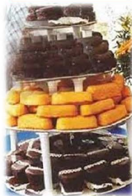
RED NECK CAKE, 3 TIERS OF DING DONGS, TWINKIES, AND CUP CAKES

Featuring Live Music by: SHOWDOWN (Country, Rock & Blues) 7-11 PM