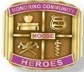
Moose Legion Pin