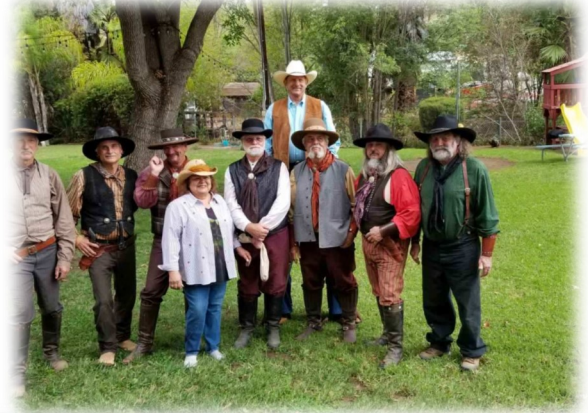
Fun Times in the Old Lodge for All!