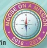
Moose Legion Pin