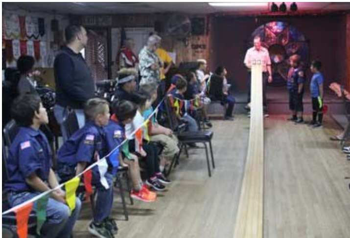
Welcome to the Derby Races!