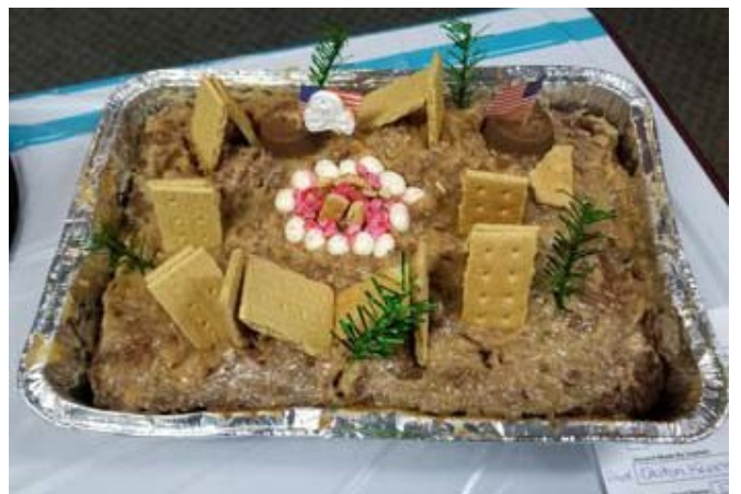
Camp Ground or Camp Cake, you guess!