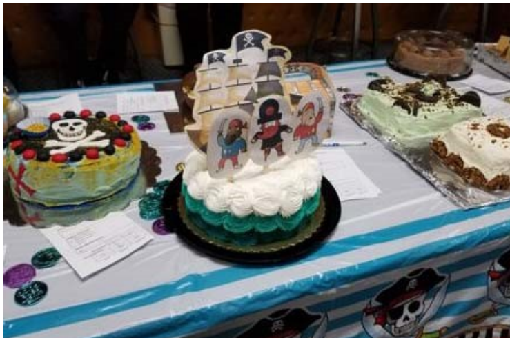
Now this is what you call an interesting cake auction!