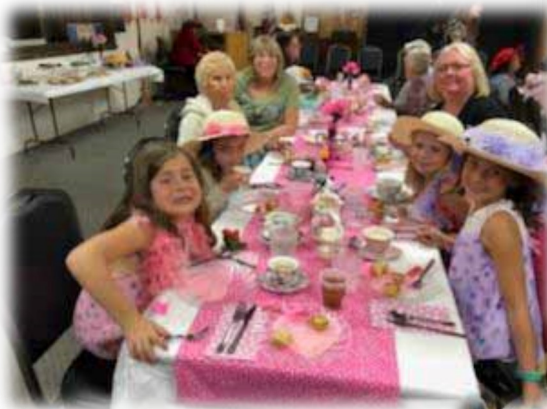
Grandmas and Granddaughters enjoying tea time.

The smiles from these young ladies all dressed up tells it all. Dress up and tea, what a fun combination!