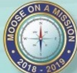
Lodge & Chapter Pin

Moose On A Mission lapel pins are presented by your Lodge, Chapter or Moose Legion to members that sponsor their first member during this campaign.