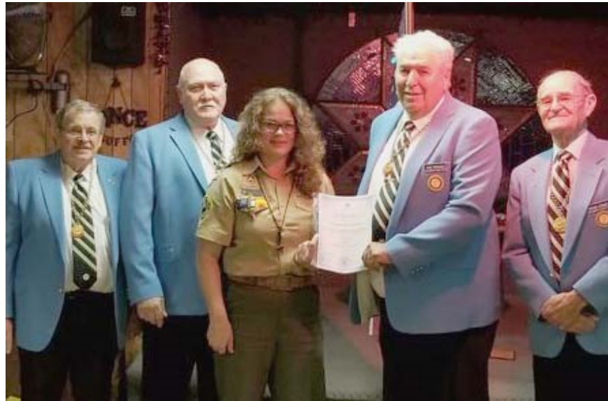
LOOM Board of Officers being presented with the Boy Scout Pack Charter