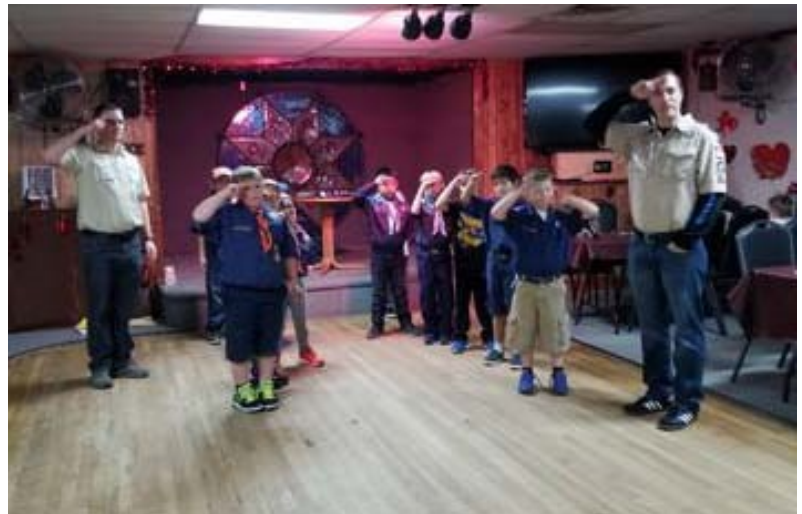
Boy Scout Salute to God & Country