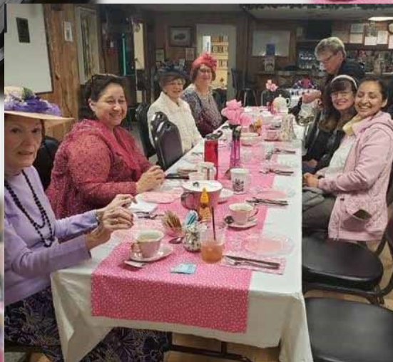
Lovely hats and manners, Ladies! Pinkies up!