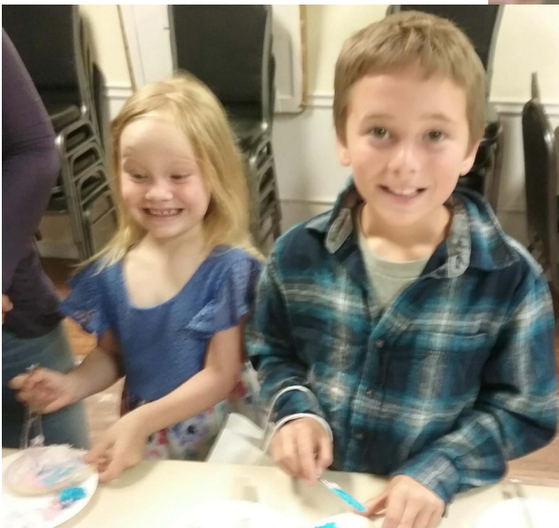
Happy to be putting lots of frosting on their cookies

Crafts, Cookie Decorating, A visit from the Easter Bunny, an Egg Hunt and Lunch, overall, a FUN DAY!