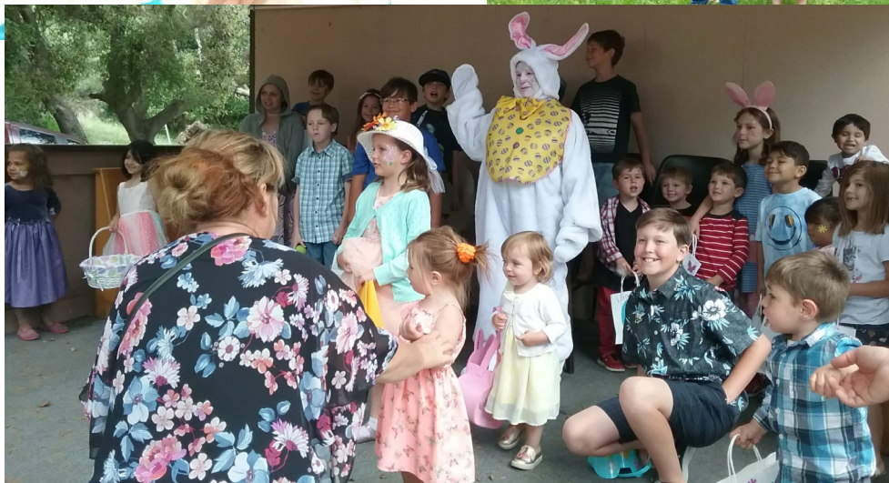
The Easter Bunny with anxious children waiting for the Egg hunt to begin!