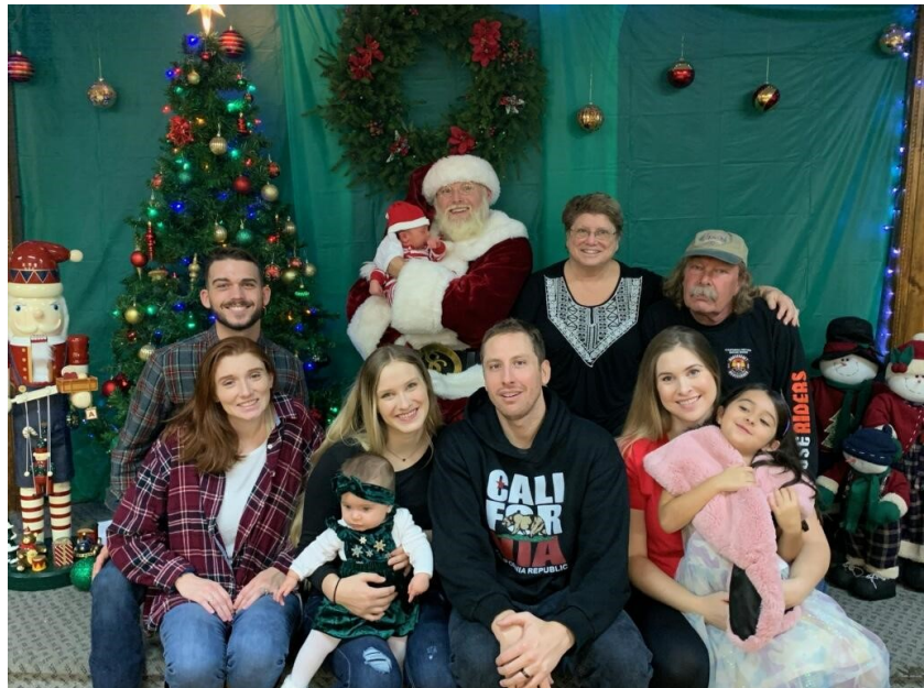
Children's Christmas Party 2019