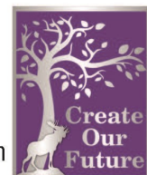
Moose Legion Pin