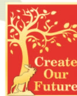
Lodge & Chapter Pin

Sponsor 1 Member Moose - Create Our Future pins are presented by your Lodge, Chapter or Moose Legion to individuals that sponsor their first member during the campaign.