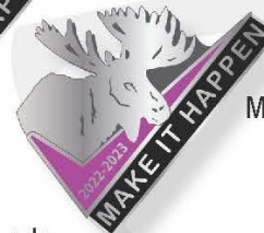
Moose Legion/ Women of the Moose pin